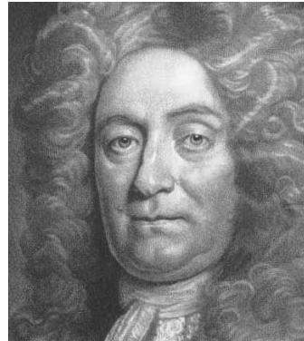
Sir Hans Sloane.

£20,000 to support the British Library's ongoing Exhibition Programme. The Library plans to hold two major exhibitions a year in its PACCAR Gallery.