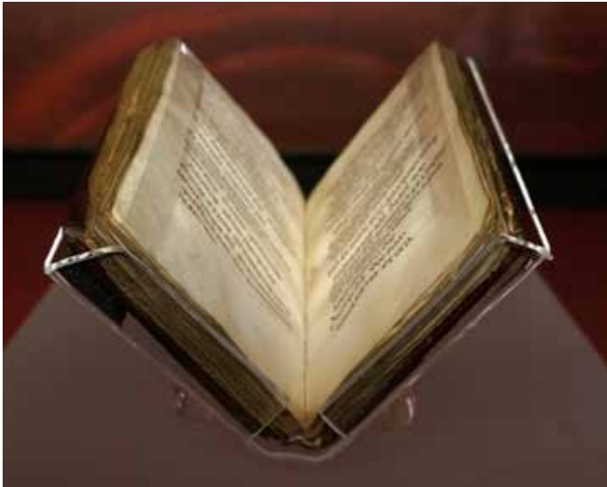
The St Cuthbert Gospel on display in the British Library's Sir John Ritblat Gallery.

£50,000 towards the purchase of The St Cuthbert Gospel . A specimen of a 'pocket' Gospel intended for personal use, it is a copy in Latin of the Gospel of St John, probably written by a local scribe at the internationally renowned twin Northumbrian monasteries of Wearmouth-Jarrow in the late 7th century. It was interred with St Cuthbert ( d 687) at his reburial on Lindisfarne in 698 and found in his coffin at Durham Cathedral in 1104. The manuscript retains its original, uniquely well-preserved, decorated red leather, goatskin binding and is thus the earliest surviving intact Western book.